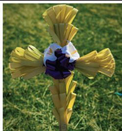
Size: 24 inches by 18 inches

Nick (856) 691-9069 or Albert (609) 501-0022