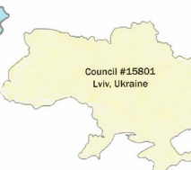
Council #15801 Lviv, Ukraine