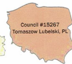
Council #15267 Tomaszow Lubelski, PL

KoC #2531 in Vineland, NJ is working closely with the KoC #15267 St. Wojciech in Poland. Together they are supporting John Paul II Council #15801 in Lviv, Ukraine. United in charity and fraternity, these Knights are supporting the Ukrainian refugees in Poland and the brave citizens who stayed behind to defend their country.